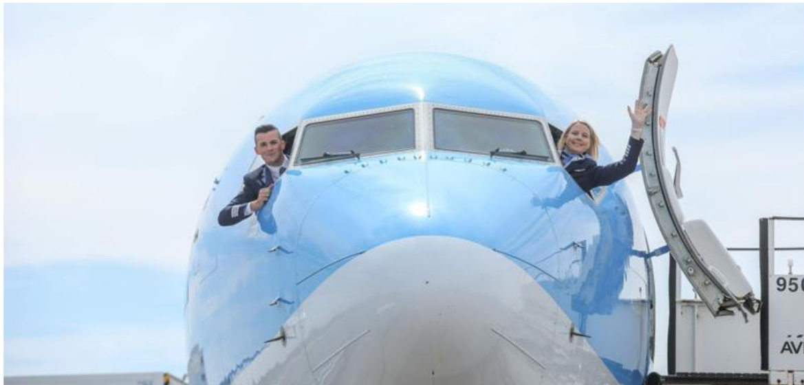
TUI Launches Fully Funded Pilot Training Scheme In The UK

TUI Airways has opened recruitment for its latest pilot training scheme, which will commence in September 2023. A total of 30 cadet pilots are expected to be trained over the 19-month program, going on to fly the airline's fleet of Boeing 737 aircraft.